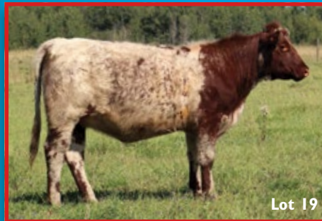
Sharom Shorthorns 780.398.2093