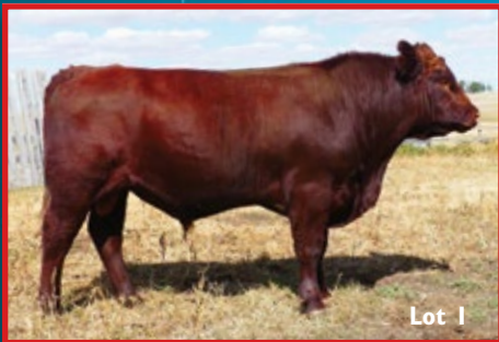
Paintearth Shorthorns 403.882.2253