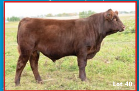
Schutz Cattle Co. 780.953.0649