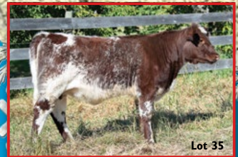
Peterson Family Farms 780.608.6197