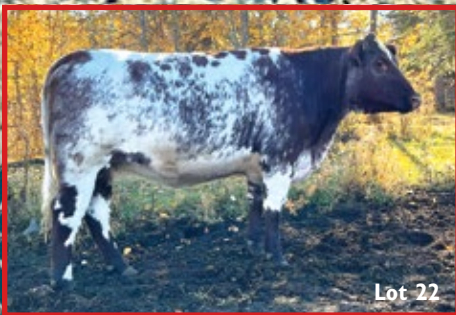
Starbright Shorthorns 780.201.2785