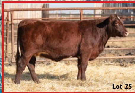
Majestic Shorthorns 403.704.6121